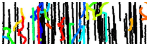
trajectories (x-y plane)